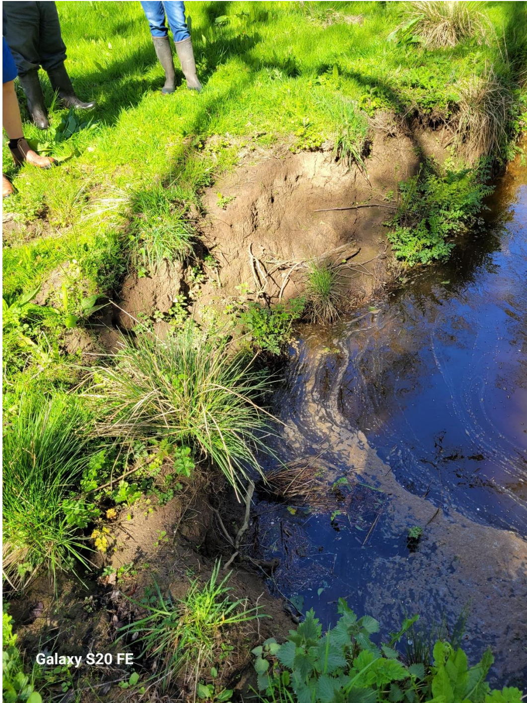
Photo 6. Bank slumping caused by a large back eddy, nibbling the toe of an undefended margin. Note the fine, friable soils here, with no complex root systems tying in the soil. When banks slump like this, often a new toe to the bank forms from the sods that slide into the margins. Provided there is enough light, these then provide a platform for pioneering emergent plants to root. A good option here is to heel in sods of sedge won from other locations to help accelerate a naturally recovery.

Some consideration of future riparian land use is required. Currently the banks are occasionally trimmed or mown but it is understood that grazing options are also being considered for the future. It is highly recommended that the bank tops are left to develop a much wider, thicker and more robustly vegetated buffer zone, which will require stock fencing if grazing is being considered. If left unfenced,