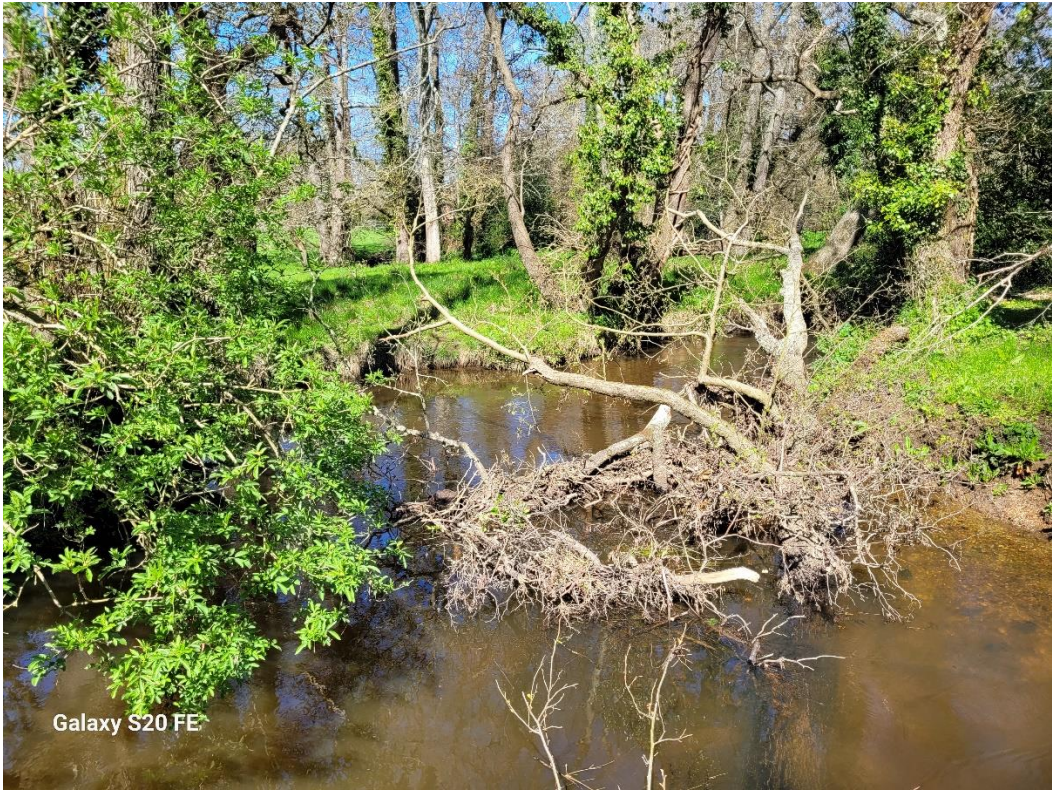
Photo 7. Large and coarse woody material accumulating within the channel. Both forms of woody material are extremely valuable and whenever possible should be left in situ. If a large debris dam forms, then it might be necessary to ease out a gap to ensure that fish migration is still feasible.