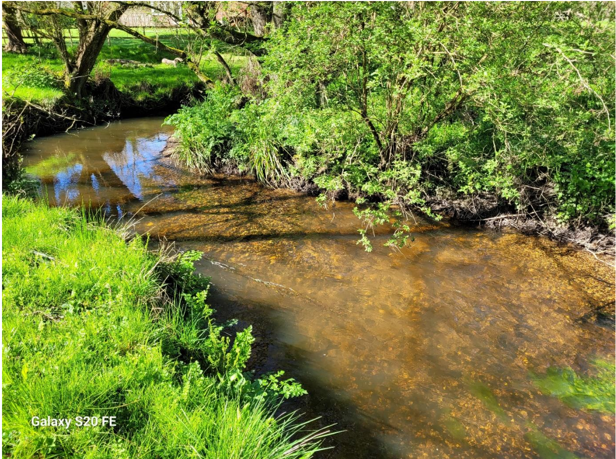
Photo 1. Numerous, meander bends supporting deeper pools and valuable shallow pool-tails and gravel-bottomed riffles provide the full range of habitat required for all trout life-stages.

Tree shading was mainly cast by mature bank-top alder trees Alnus glutinosa , but some low-level cover was also provided by elder Sambucas nigra and goat willow Salix caprea .