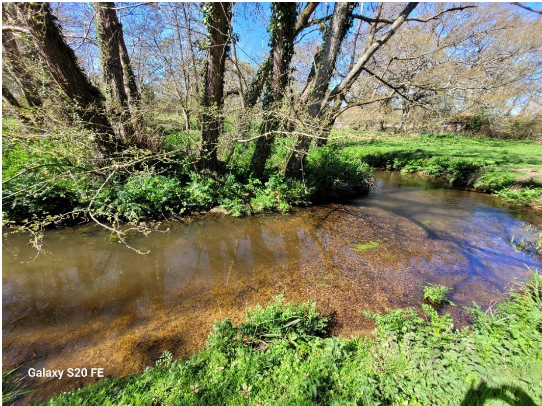
Photo 8. A classic pool and tail with the remains of a large seatrout redd