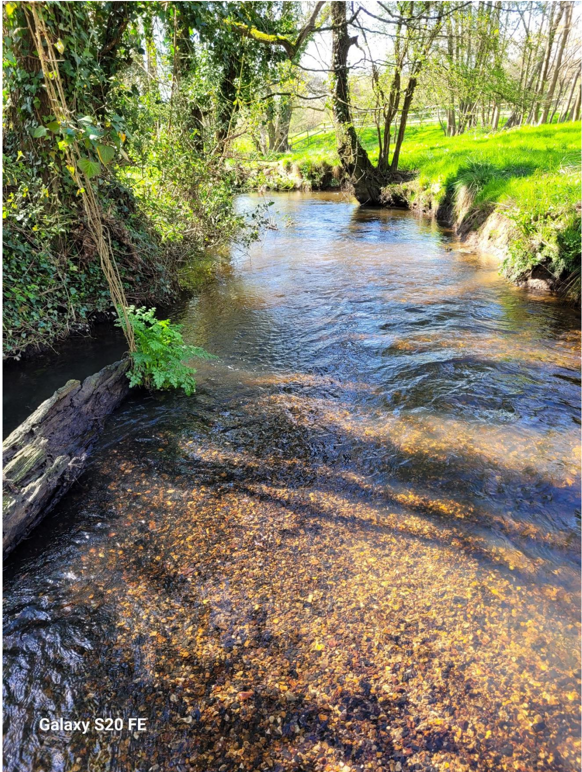
Photo 3. Shallow broken riffle habitat provides excellent opportunities for parr to hold safely in water too shallow for large predatory adult trout. The presence of the naturally fallen large wood material provides an excellent “cover log” and adds value to this important habitat.