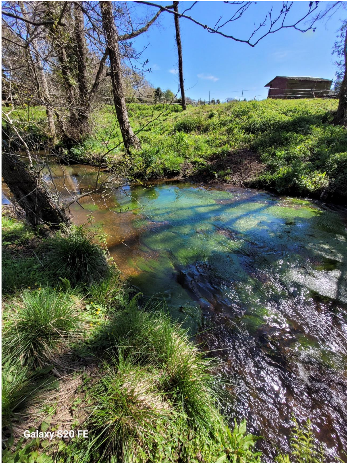
Photo 4. A significant bed of submerged starwort, where a gap in the tree canopy enables sufficient light to hit the riverbed at a suitably shallow section.