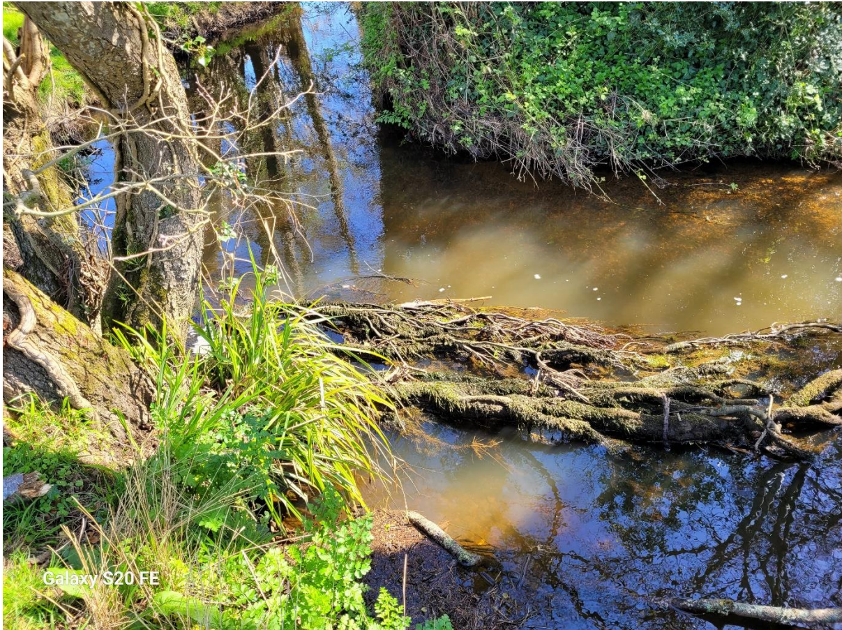
Photo 5. Complex root system from a bank-top alder provides a potentially safe holding area for an adult trout.

In a few areas there was evidence of slight bank erosion (photo 6), sometimes caused by back eddying adjacent to steep banks, with little or no root systems available to help bind in the soils at the toe of the bank. The river has a very active morphology, and some bank erosion is inevitable and completely natural. Indeed, some bed and bank erosion is essential to maintain fresh gravel supplies, vital for maintaining the ecology of the river.